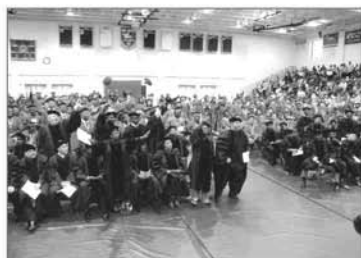
Four Years of Study brings a Great Celebration!

North Carolina College of Theology Stands Without Apology as Being a Bible College only. “Equipping men and women to effectively serve.”