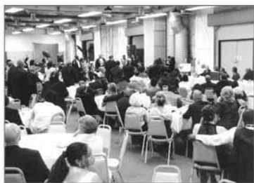
2008 Black Tie Gala Dinner Honoring Dr. W. Baltimore