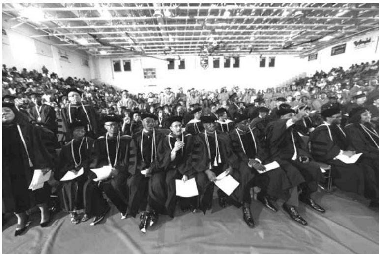
The 2013 North Carolina College of Theology Graduation!

If you would like to become a part of one of our established schools or have a school in your local church, please call the NCCT office at 910-395-5593 or send an email to drjudycook@ncctonline.com .