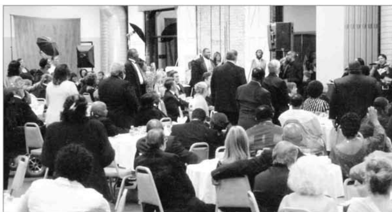
The Black Tie Gala Dinner was wonderful!