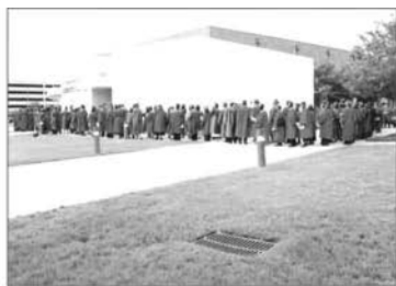
823 Ready for 2007 Graduation