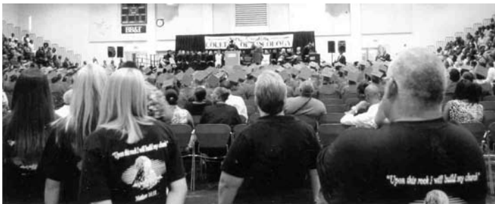
A spirit of worship at the graduation!