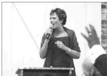
First Lady Judy N. Cook speaking during the 2009 Black Tie Gala Dinner